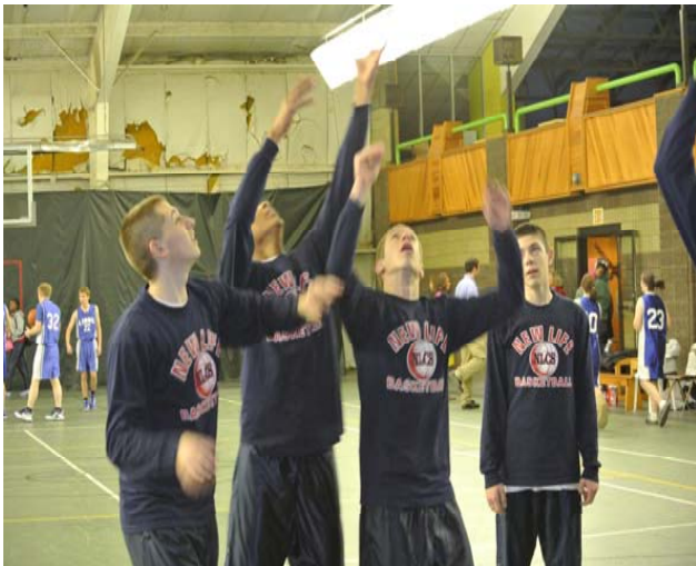
2012-2013 NLCS Boys Warming Up for game (Above) 2012-2013 NLCS Girls Warming Up for game (Left)

Basketball and volleyball have been played at New Life for several years, and as our most popular sports, we have continued to improve, season by season. The boy's basketball team (22-5) ended this season with 2 championship titles, the New York Christian Athletic Association Small School State championship and the NFCAA title. The girls also ended a competitive volleyball season with a 12-3 record. But as our teams continue to succeed, our facility remains lacking. We rent the St. Bonaventure Fitness Facility in Olean for our home games during the sports season. This has been useful, however, it is cumbersome when scheduling, preparing for games, transporting seats for players and fans, and it is also costly, especially in the long run.